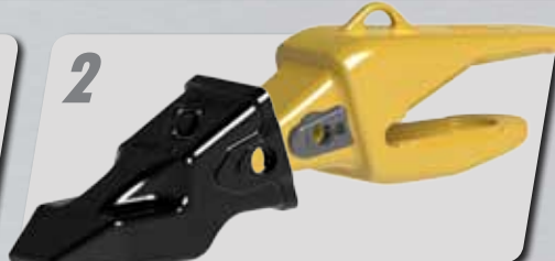
Fit Tooth over Nose & Converter