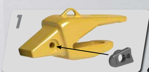
Insert Converter into Adapter