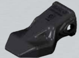
Heavy Duty Abrasion