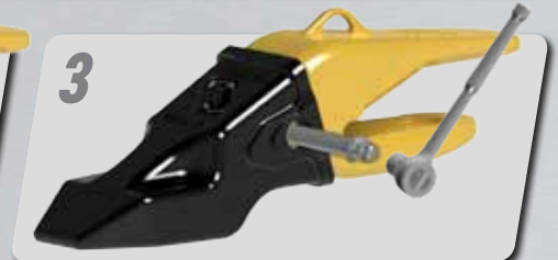
Insert Helical Pin & Rotate 180 degrees with Socket Wrench to Engage Lock